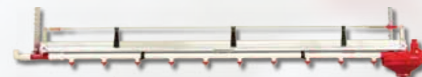
Aluminium Rail Support Option