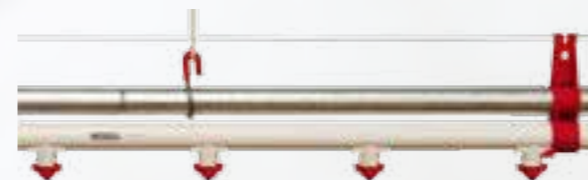
Round Pipe Support Option